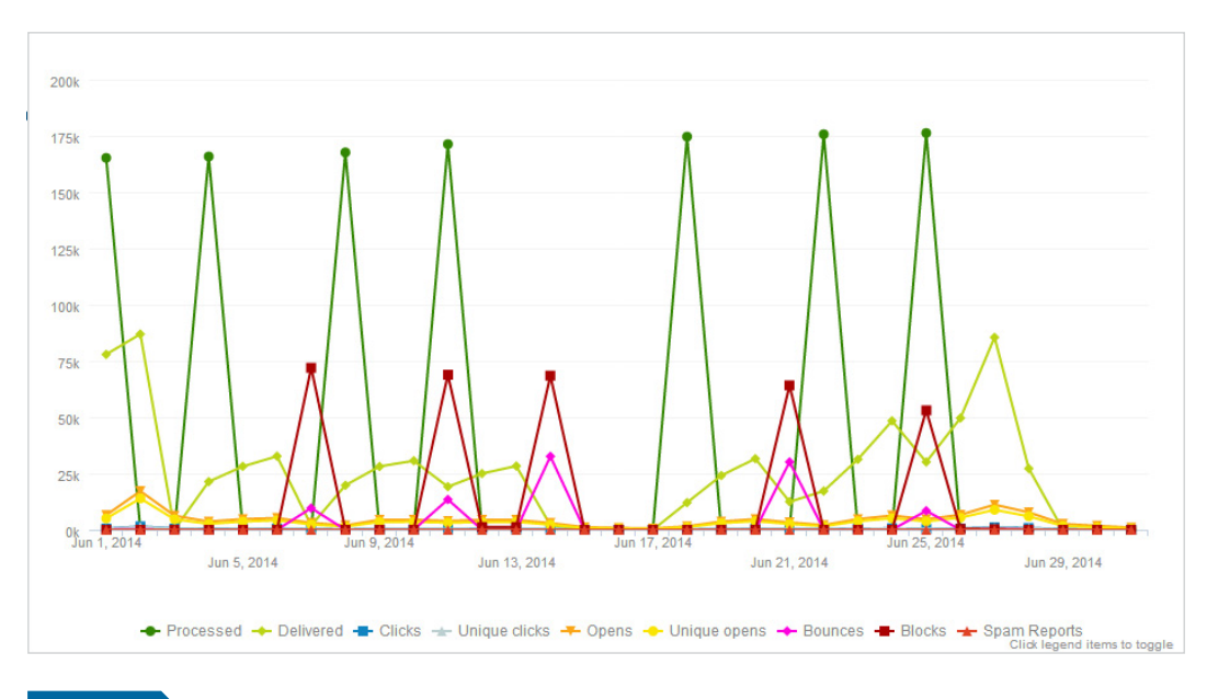
FIGURE 6 Image of SendGrid user who was blocked

There are many blacklists, but you should check to see if your IPs or domains are on any of these popular lists: